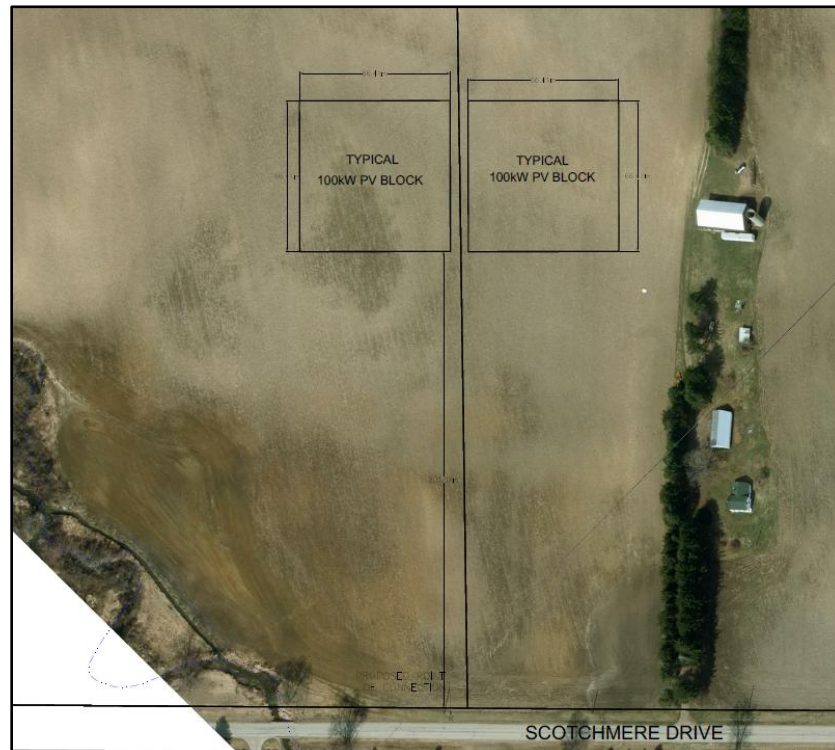
Figure 1. Aerial photo of the Project location.

The proposed solar power project is named Ground Mount Solar PV Power Project – L.P #5 (the Project). It is being initiated by Canadian Solar Developers Ltd, based in Barrie, Ontario. Exp Services Inc will be representing Canadian Solar Developers Ltd during the application and approval process. The Project is located in the Township of Strathroy-Caradoc, which is located approximately 25km west of the City of London. The project address is L.P #5 8338 Scotchmere Dr Pt Lot 15, South East Pt, Concession 8, Strathroy-Caradoc, ON, N0L 2L0. The Project area and local road map are illustrated in Figure 1 and 2: