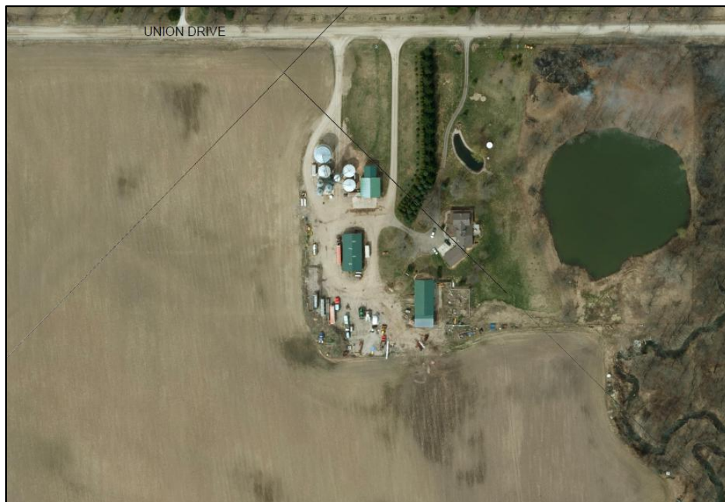
Figure 1. Aerial photo of the Project location.

The proposed solar power project is named Ground Mount Solar PV Power Project – L.P #1 (the Project). It is being initiated by Canadian Solar Developers Ltd, based in Barrie, Ontario. Exp Services Inc will be representing Canadian Solar Developers Ltd during the application and approval process. The Project is located in the Township of Strathroy-Caradoc, which is located approximately 25km west of the City of London. The project address is L.P #1 9307 Union Drive, Strathroy-Caradoc, Ontario, N0L 1W0. The Project area and local road maps are illustrated in Figure 1 and 2: